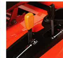
Hydraulic mower lift lever