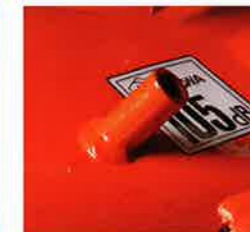
Deck cleaning pipe for connecting water hose