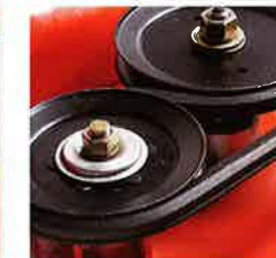
Ultra-durable, long-life hexagonal belt