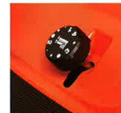
Easy reach cutting height adjustment dial